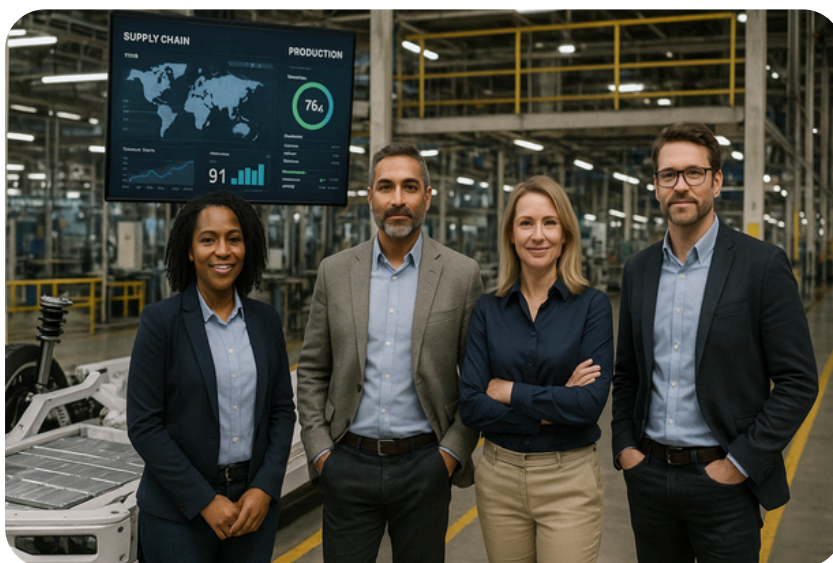
WORK SAMPLE FROM HUMMINGFLOW.DIGITAL